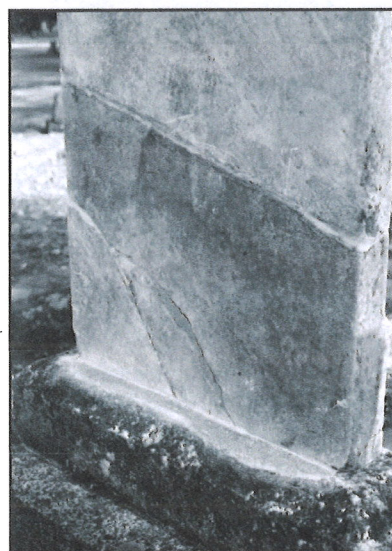
Detail view of reverse (west) side of I.N. Gilbert stone showing solid epoxy repair joints and build-up of the plinth keyway shoulder. The shoulder had worn away

Right: Repaired headstone of Marietta Stanton Gilbert. The die end was shaped with a tab inserted into the plinth keyway. The tab and lower section of the die were securely re-mortared into the keyway and upper sections of the broken die were joined to the lower.