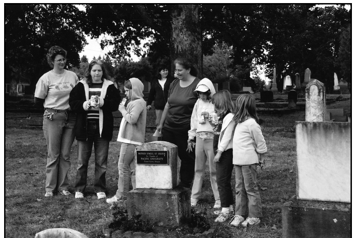
Brownie Troop 231, working for a unit badge on the theme "Listening to the Past," gathered in September with their leaders at the gravesite of Tabitha Brown, beloved educator and Oregon pioneer mother symbol.

Boy Scouts of America, Troop 77 , Second Ward, Church of Jesus Christ of Latter Day Saints, nine Scouts Alpha Chi Omega Sorority , Willamette University, thirty-eight women Pey-Ko-Nay Club of Camp Fire U.S.A. , six members Brownie Troop 231 , four Brownies Morningside United Methodist Church Youth Group , ten members